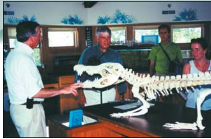
Buck, our beloved alligator!

The Dewees whale skeleton is currently awaiting the arrival of its skull and left flipper, which were sent to the